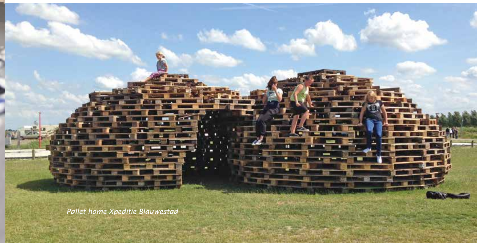
Pallet home Xpeditie Blauwestad

Local sports clubs are supported with funds and material, for example by sponsoring the shirts of various football teams. We also support annual local events, such as Poppodium Grenswerk in Venlo and Dickens Day in Beerta.